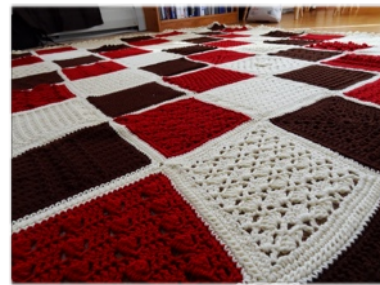
Left: Kaitlyn's recently crocheted afghan (Each of the 63 squares has a different design)