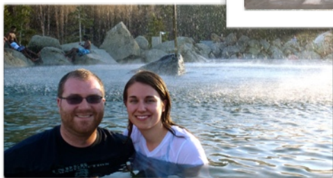
Above: Enjoying a swim in the hot springs during our family road trip