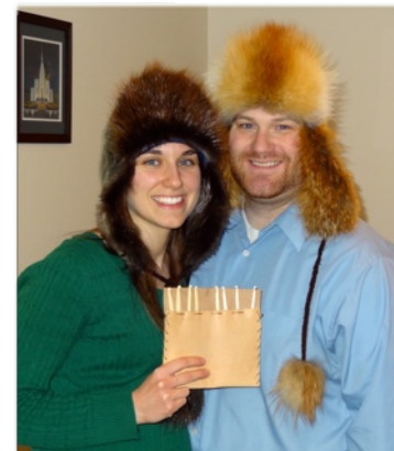
Right: Showing off our new christmas gifts: native sewn fur hats and ivory carved crochet hooks