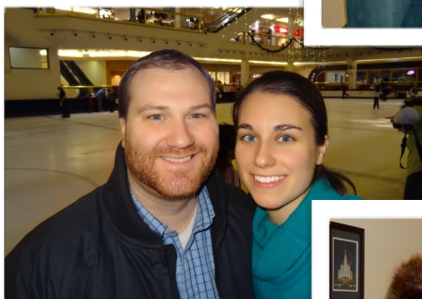
Above: Trying our hand at ice skating to celebrate our 5th wedding anniversary