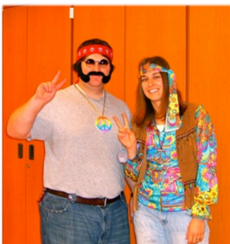
Below: Dressed up for the school's hippie day