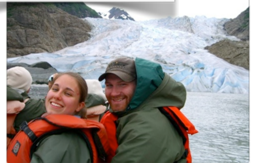
Above: Canoeing in front of a glacier