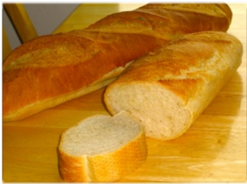
Above: Tim's homemade french bread